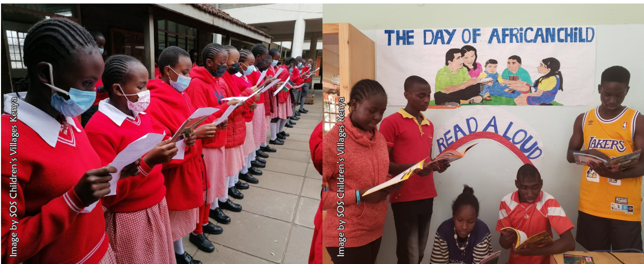
Pupils from SOS Hermann Gmeiner Schools from across the SOS Children's Villages participating in the Read A Loud activity.