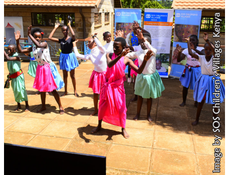
Children from SOS Children's Village in Meru.