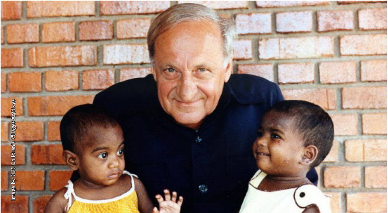
Hermann Gmeiner founder of SOS Children's Villages poses with children.

On June 23, SOS Children's Villages in Kenya joined the rest of the world in celebrating 'SOS Day' in honor of the 102 nd birth anniversary of our founder Dr. Hermann Gmeiner. Hermann founded the first SOS Children's Village in Tyrol, Austria, in 1949. As a child welfare worker, Gmeiner saw how children orphaned as a result of World War II suffered. He was committed to helping them by building loving families and supportive communities.