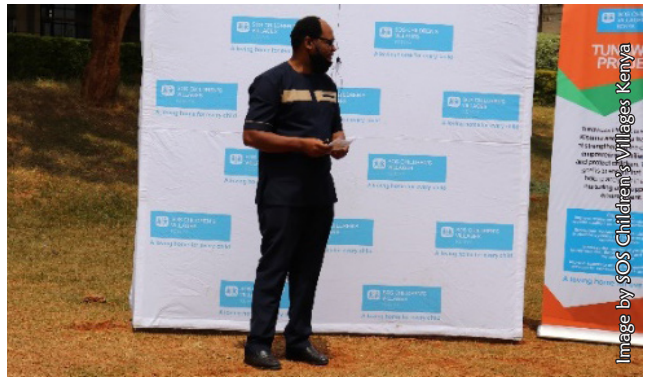
Events of the FSP TUNAWEZA program launch in SOS Children's Villages in Meru.